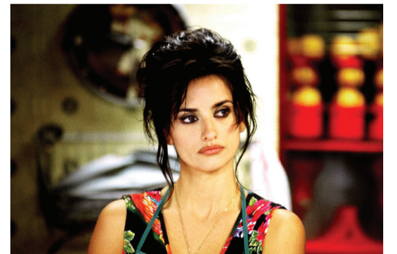
Penélope Cruz from Volver

In cooperation with the Jerusalem Cinematheque